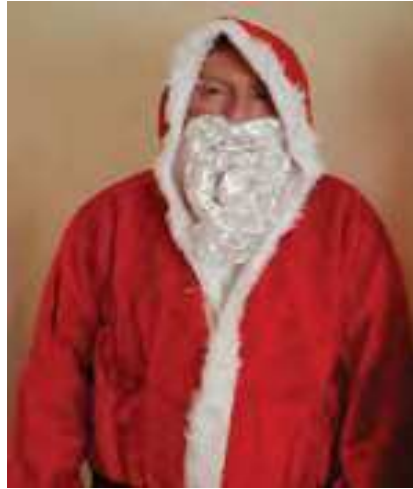
C6012 Father Christmas Suit & Beard