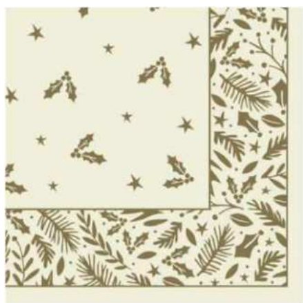
X63-TTN 40cm/3ply Cream & Gold