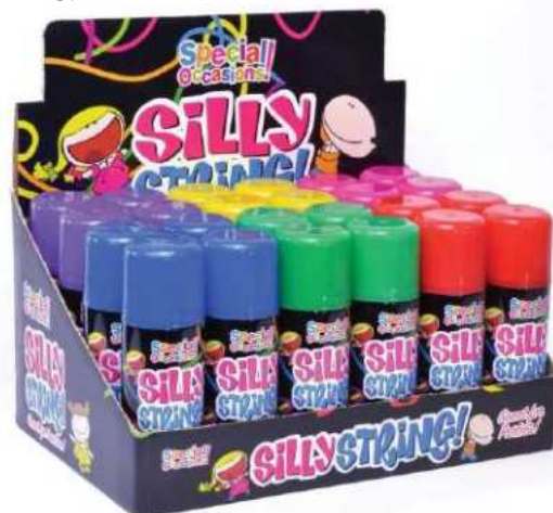
GJ086 Silly String 100g

D A Cooke Wholesale Tel: 01793 831118 Email: ian@dacooke.co.uk