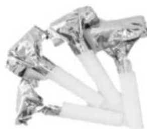
5411SV Silver Foil Blowouts x 144