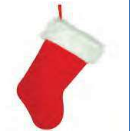
S6031 90cm Christmas Stocking