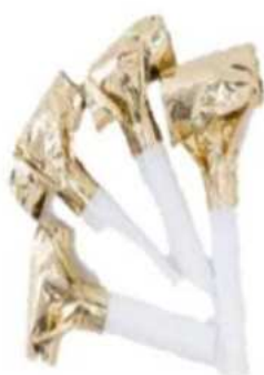
5411GD Gold Foil Blowouts x 144