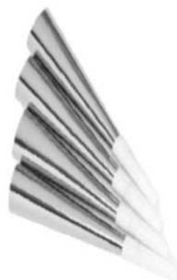
TW10SV Silver Tooters x 144

D A Cooke Wholesale Tel: 01793 831118 Email: ian@dacooke.co.uk