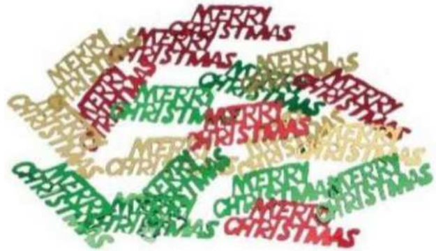
CON12-MC Merry Christmas Confetti Stars