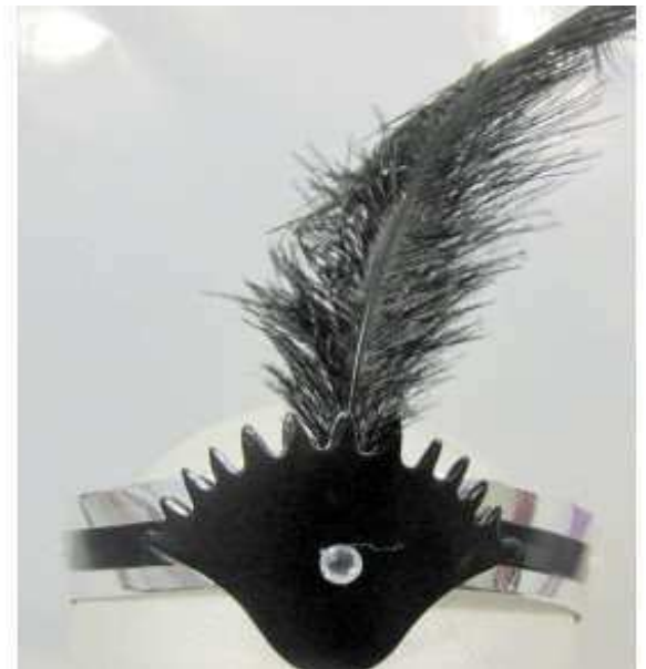
Silver Headband with Black Feather P1831/BK – 25 per carton

D A Cooke Wholesale Tel: 01793 831118 Email: ian@dacooke.co.uk