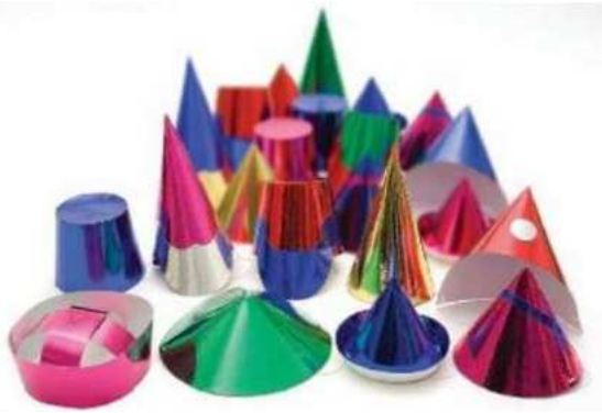
B15 Petite Party Hats 144 - Assorted