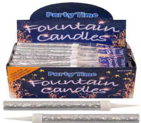
12cm Ice Fountains