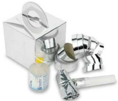
NBOX-SV Silver Boxes