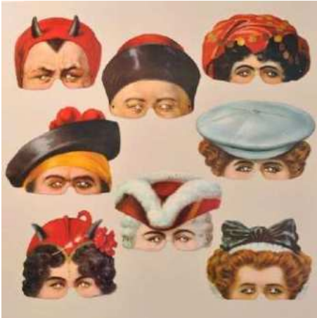
R416 Madame Tussauds