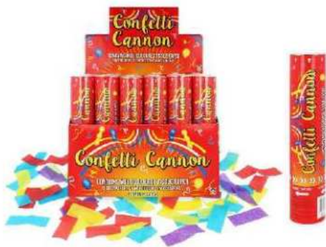
PP20 – Confetti Cannon 20cm x 24