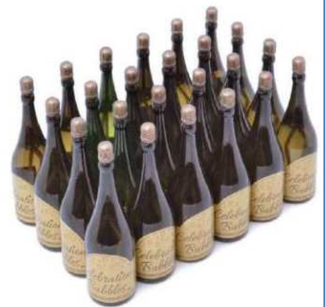
Blow Bubbles 9cm