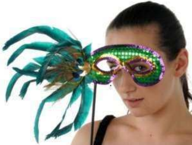
F1440 Assorted Masks (to clear)