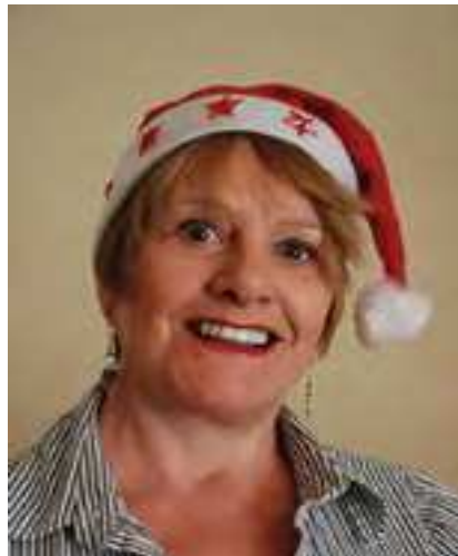
H6552 Santa Hat with Lights