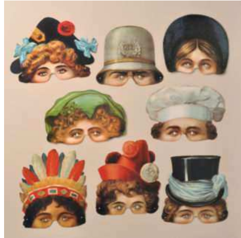
R422 Spielzeugmuseum Nurnberg