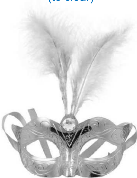
FO-61661 Feather & Metallic Silver