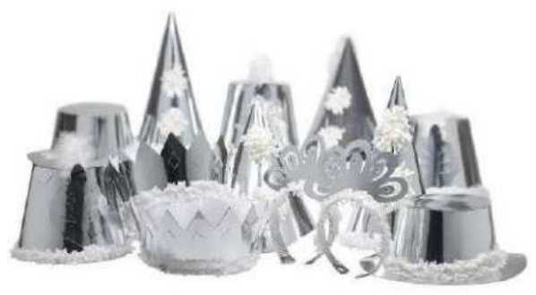
5443S Premiere Silver Hats 50 - Assorted