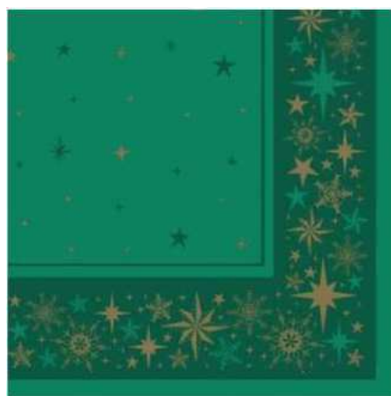
X63-MYB-MP 40cm/3ply Festive Green