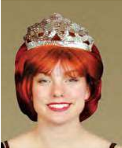
23513 Silver Tiara (23512 Gold Tiara)