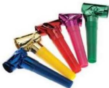
5411 Foil Blowouts x 144