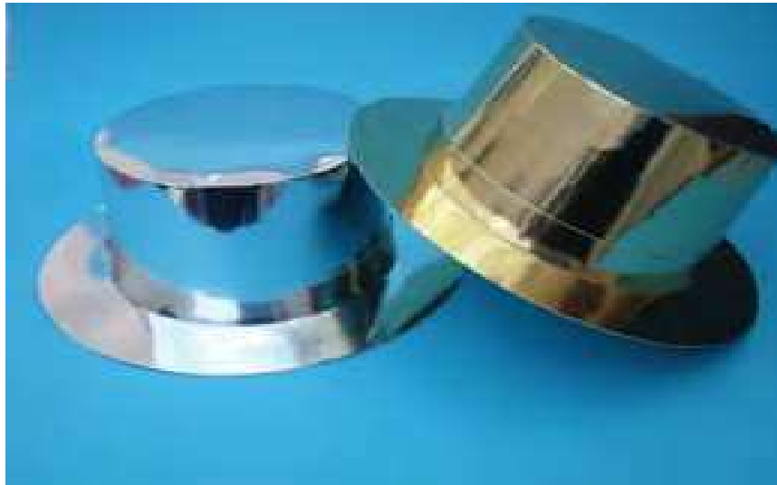
Top Hats – Gold, Silver or Black 25 per carton