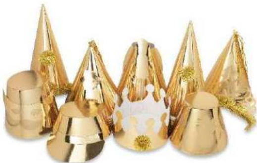
5443G Premiere Gold Hats 50 - Assorted