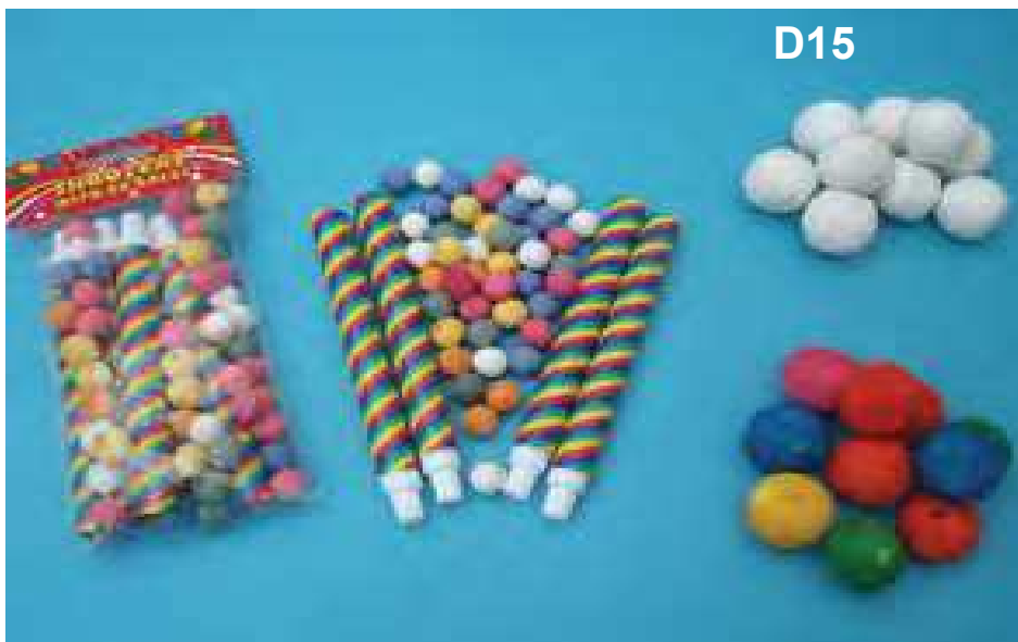
BP36 Blowpipes & Balls