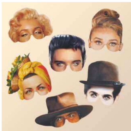
R476 Icons of the Twentieth Century