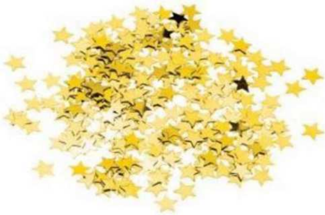
CON12-G Gold Confetti Stars