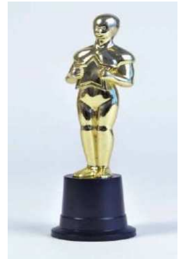
GJ426 Award Trophy