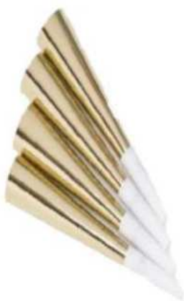
TW10GD Gold Tooters x 144