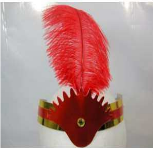
Gold Headband with Red Feather– P1831/R – 25 per carton