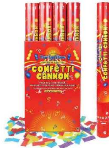
PP50 – Confetti Cannon 50cm x 12

D A Cooke Wholesale Tel: 01793 831118 Email: ian@dacooke.co.uk