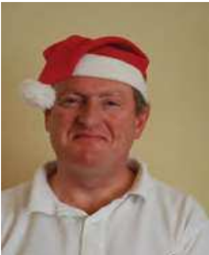
H6517 Santa Hat with Pom Pom