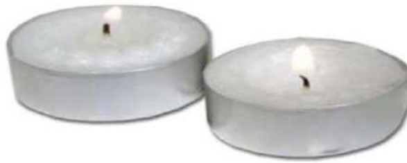
630 – 38mm T-Lights 4 hours