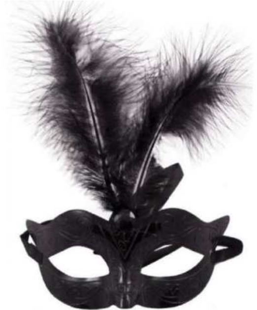
FO-61660 Feather & Metallic Black