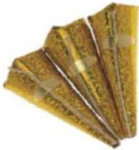
PPHGD – Gold Holographic Cone Poppers x 72