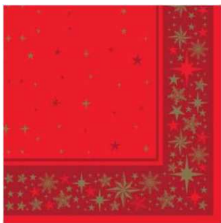
X63-MYB-R 40cm/3ply Festive Red