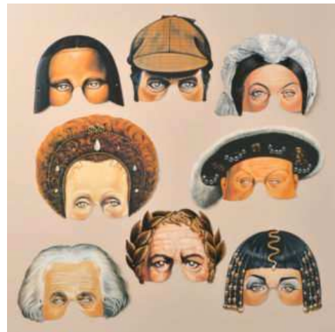
R461 Historical Figures