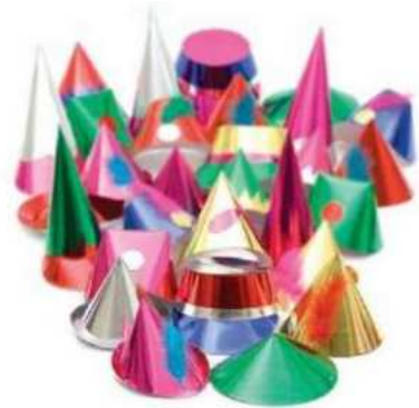
B11 Starshine Party Hats 144 - Assorted