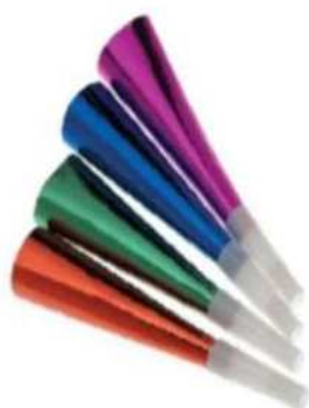
TW10 Foil Tooters x 144