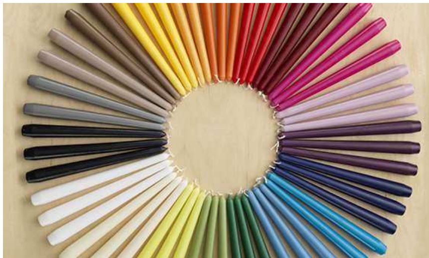
163 – 10" Dipped Candles