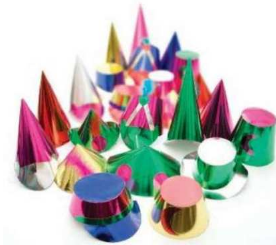
5439 Rialto Party Hats 72 - Assorted