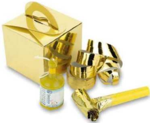
NBOX-GD Gold Boxes

Solid gold and solid silver are great for those special wedding anniversaries