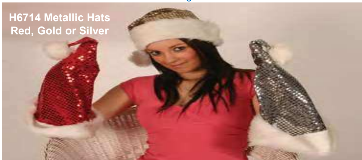
H6714 Metallic Hats Red, Gold or Silver

D A Cooke Wholesale Tel: 01793 831118 Email: ian@dacooke.co.uk