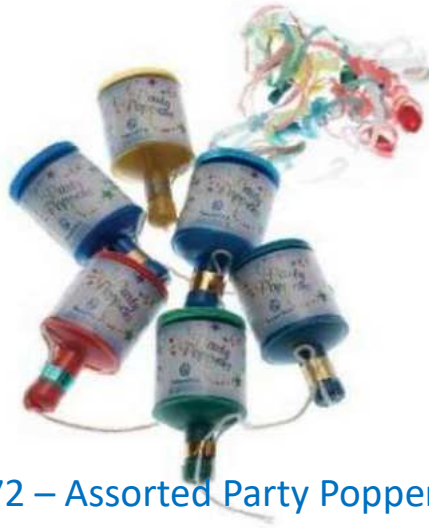
PP72 – Assorted Party Poppers x 72