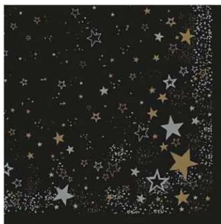
X63-MIN 40cm/3ply Midnight Sparkle

Other designs, styles and accessories are available upon request