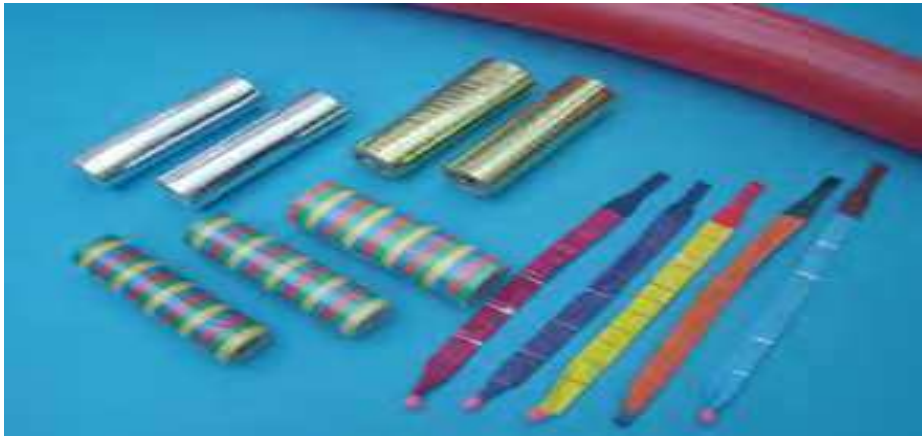
TS100 Throwstreamers RB144 Rocket Balloons