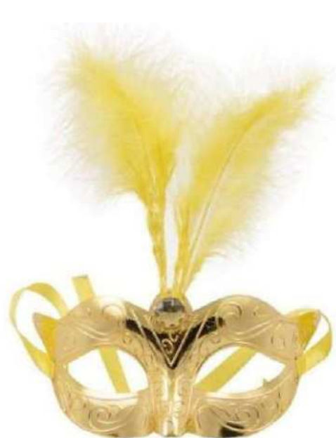
FO-61662 Feather & Metallic Gold

D A Cooke Wholesale Tel: 01793 831118 Email: ian@dacooke.co.uk