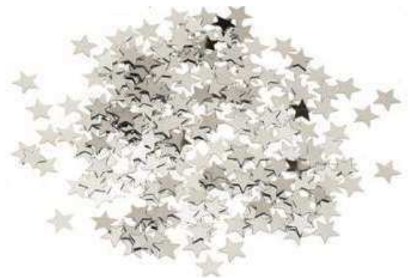
CON12-S Silver Confetti Stars