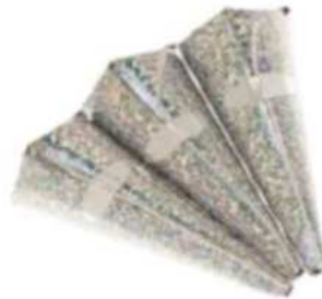
PPHSV – Silver Holographic Cone Poppers x 72