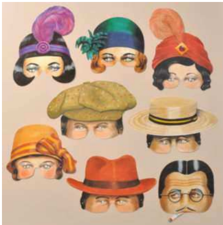
R453 Roaring Twenties